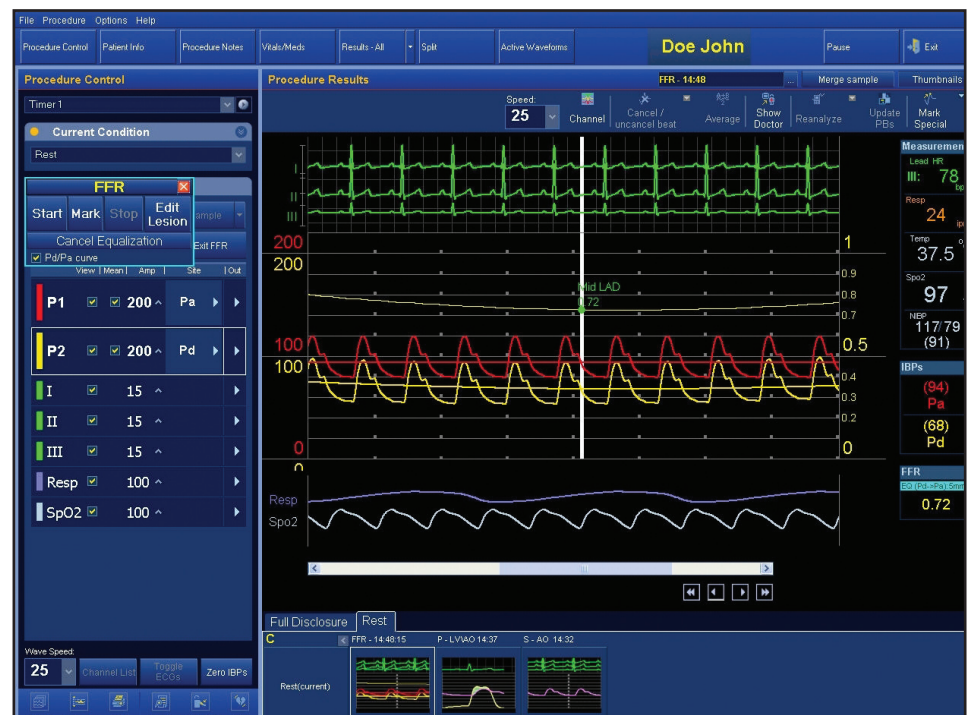
The solution offers an intuitive user interface for performing the FFR measurement as easily as any other measurement.

Horizon Cardiology Hemo is a comprehensive hemodynamic monitoring and information management application for the cath lab. This application can exist on its own or seamlessly integrate with the Horizon Cardiology™ Nurse Charting Solution and Horizon Cardiology™ Holding Area Charting™. The entire solution delivers an intuitive user interface to collect and display waveforms, hemodynamic data, procedural data and signatures that automatically populate the final physician report.