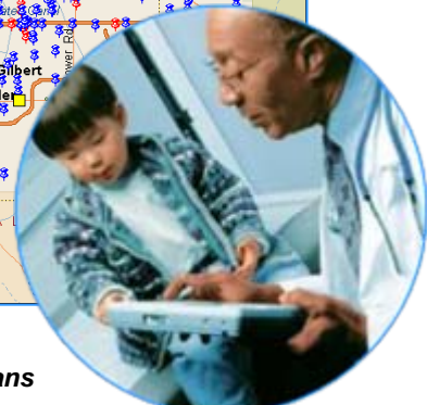
Physician alliance maps can be developed to highlight existing McKesson and VAR relationships with physicians in and around the community.